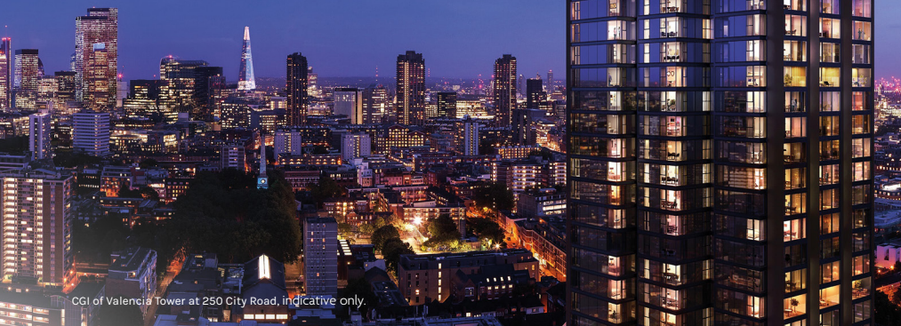
CGI of Valencia Tower at 250 City Road, indicative only.