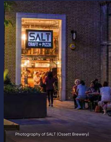
Photography of SALT (Ossett Brewery)