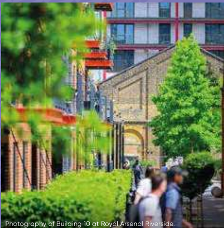
Photography of Building 10 at Royal Arsenal Riverside.

The opportunity for retailers, especially for food and drink-related businesses, is unprecedented, and with so many businesses already thriving, you will be in good company. Dedicated spaces with huge potential for passing customers, the units in Building 10 offer exceptional potential for sustained, long-term commercial success. On a practical level, both units include mezzanine levels, as well as kitchen extract flues installed to the roof, but it is the heritage features and the sheer size of the spaces that give these units the wow-factor.