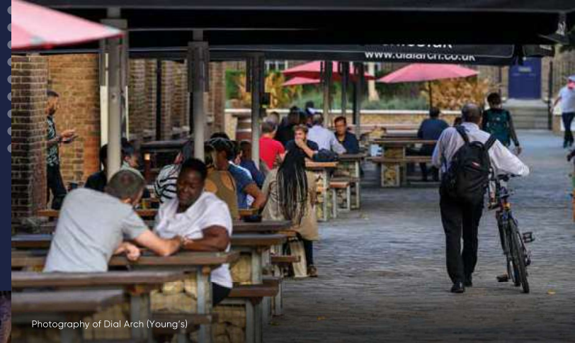
Photography of Dial Arch (Young's)

GROUND – 2,939 SQFT MEZZANINE – 1,894 SQFT TOTAL – 4,833 SQFT