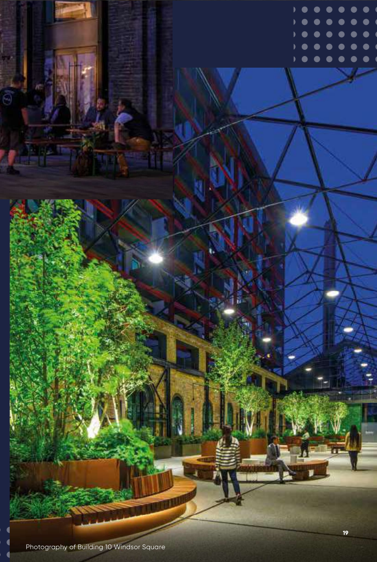
Photography of Building 10 Windsor Square