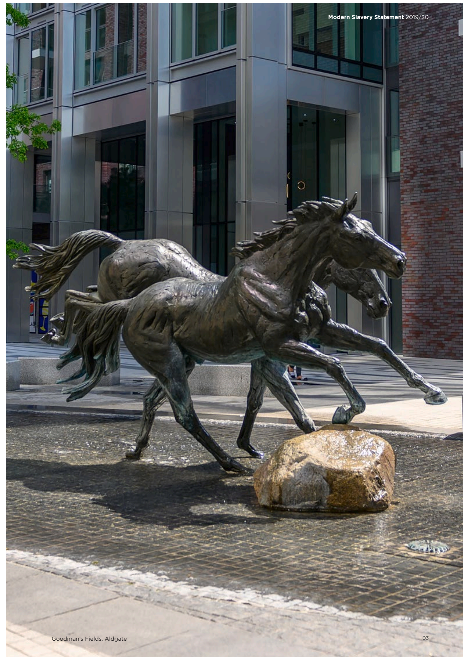
Goodman's Fields, Aldgate