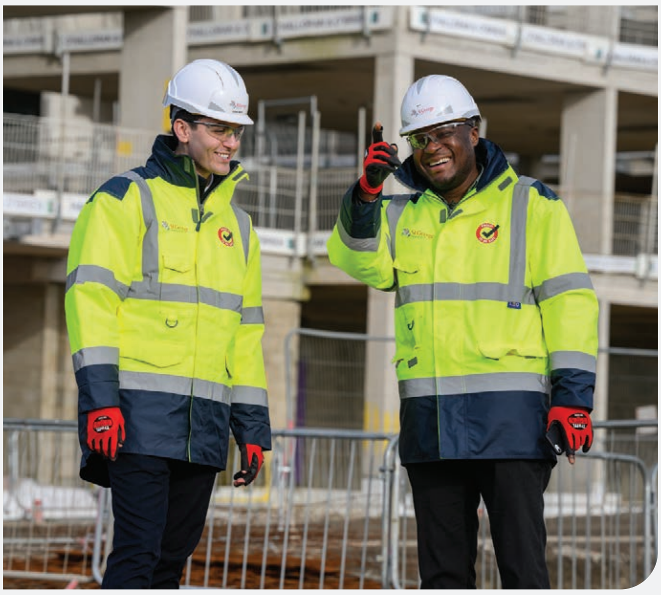
Cover images: Prince of Wales Drive, Battersea; West End Gate, Paddington