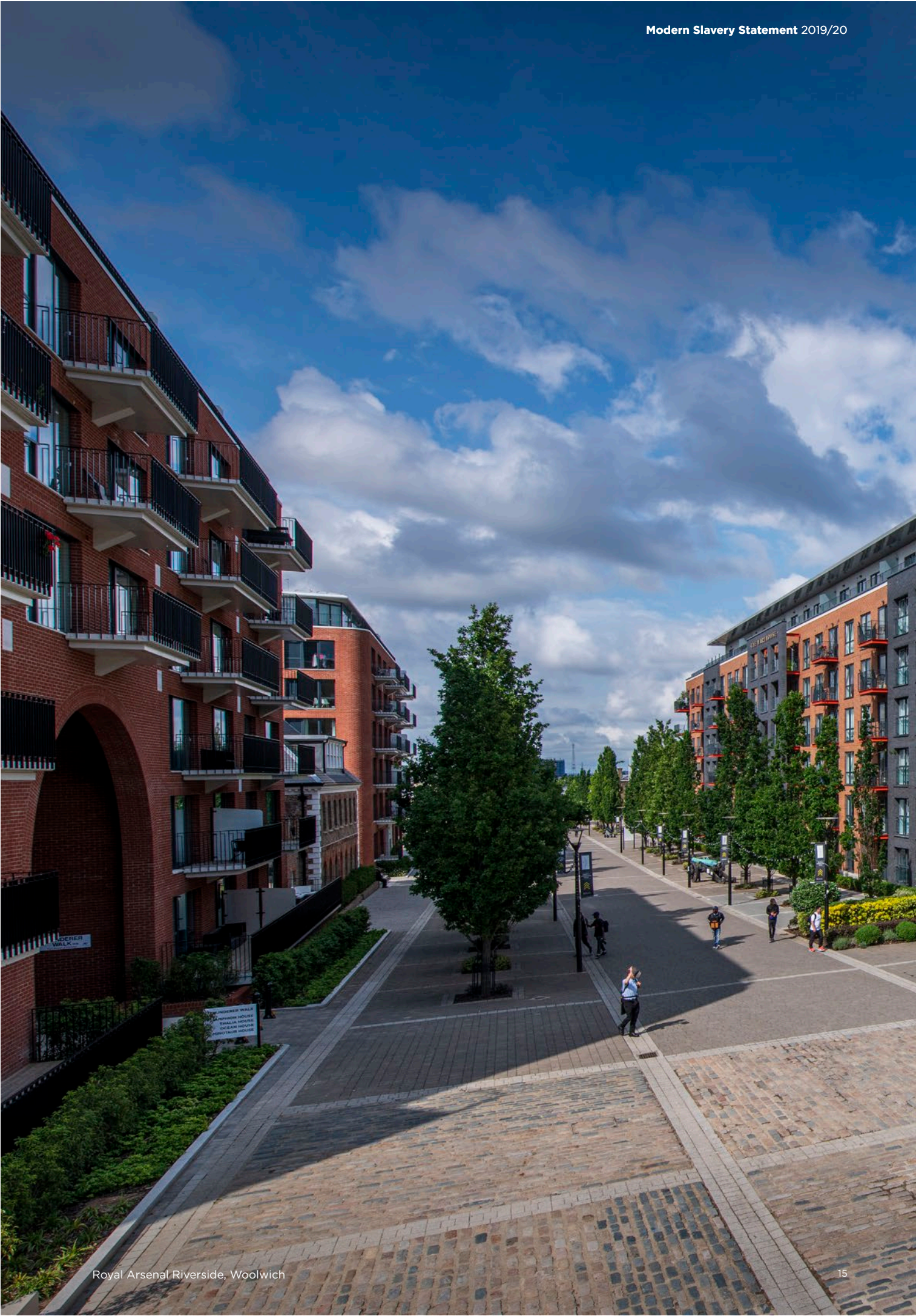
Royal Arsenal Riverside, Woolwich