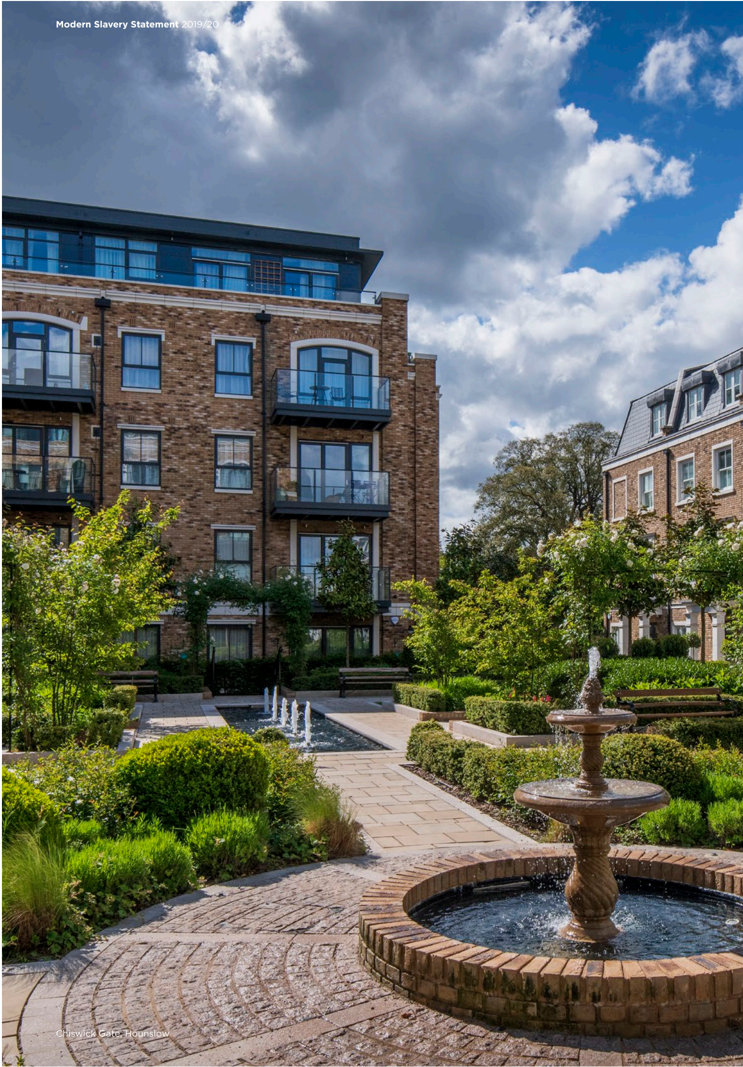
Chiswick Gate, Hounslow