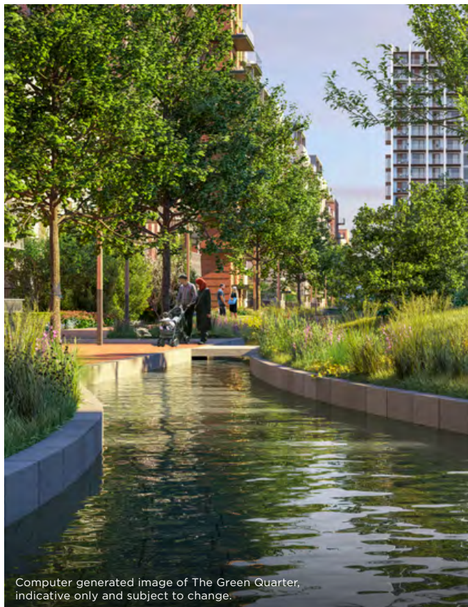
Computer generated image of The Green Quarter, indicative only and subject to change.

At 88-acres, The Green Quarter is equivalent in size to 36 Trafalgar Squares, twice the size of Green Park.