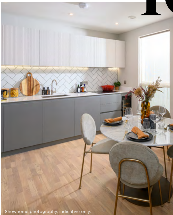
Showhome photography, indicative only.

In addition to a 10-year NHBC warranty, Berkeley operates a 2-year policy with dedicated Customer Service teams on hand 24 hours a day.