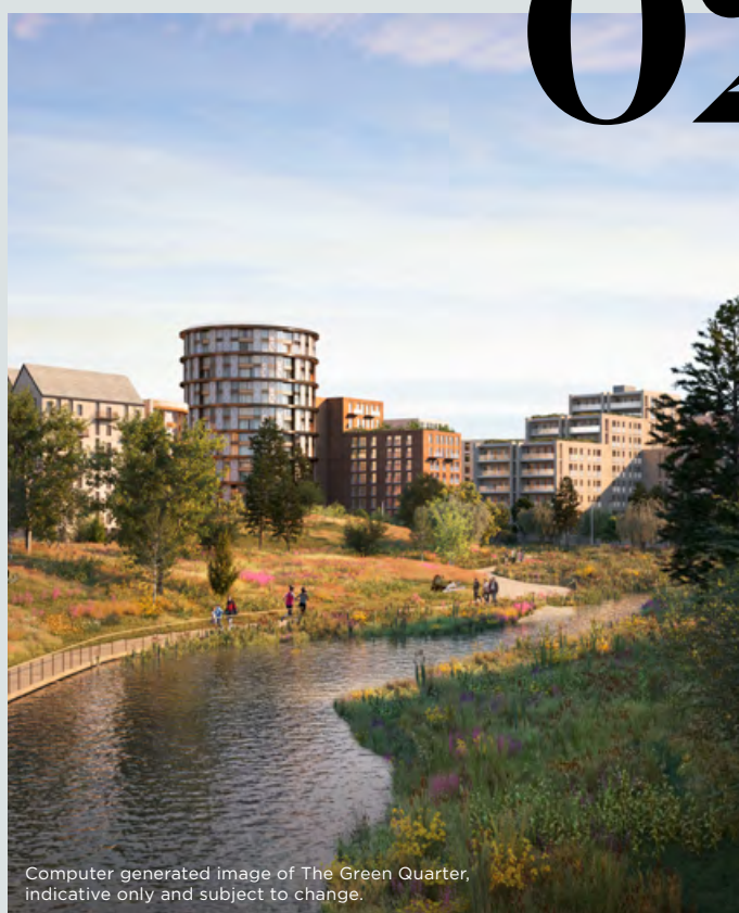
Computer generated image of The Green Quarter, indicative only and subject to change.

A new footbridge linking to the 90-acre Minet Country Park