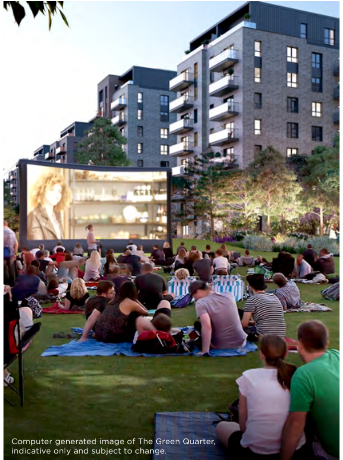
Computer generated image of The Green Quarter, indicative only and subject to change.

There will also be a new primary school, health centre and community facility.