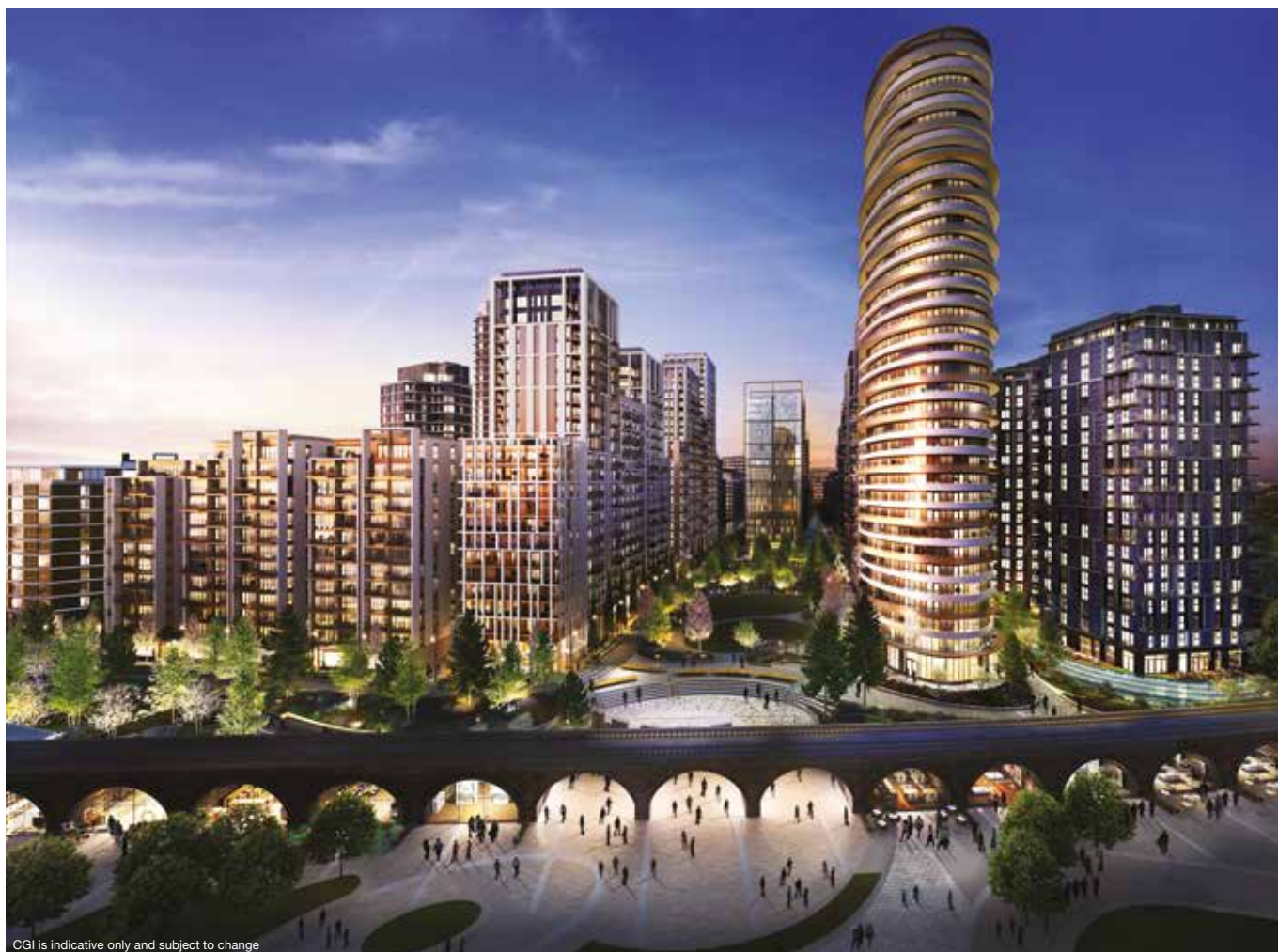
CGI is indicative only and subject to change