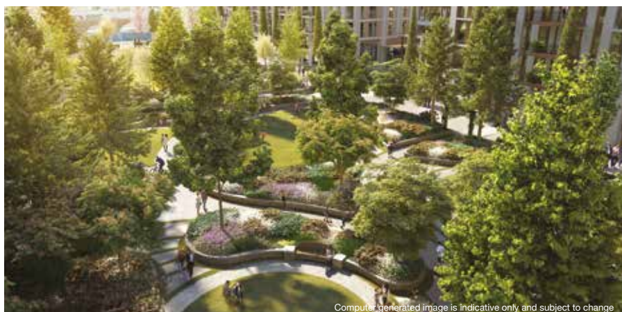
Computer generated image is indicative only and subject to change