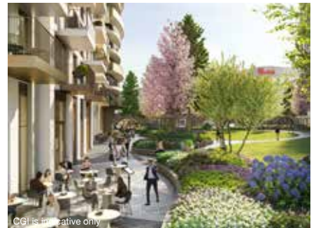
CGI is indicative only

The White City Opportunity Area is bringing 6,000 new homes and over 20,000 new jobs within the next five years. Some of the world's greatest brands in retail, media and education are transforming the site. At the centre of all this lies White City Living by St James.