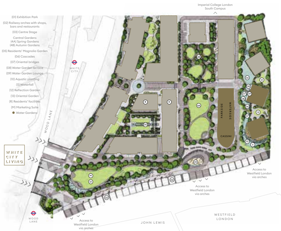
Map for illustration purposes only, not to scale. Source tfl.gov.uk 2016 from W12 7RQ or White City/Wood Lane Stations.

academics and researchers, alongside established businesses and start ups, pushing the boundaries of science and technology. Television Centre, the home of BBC Worldwide, forms a major new business district dedicated to the creative industries including a 45-room hotel, White City House by Soho House and Bluebird Café among others.