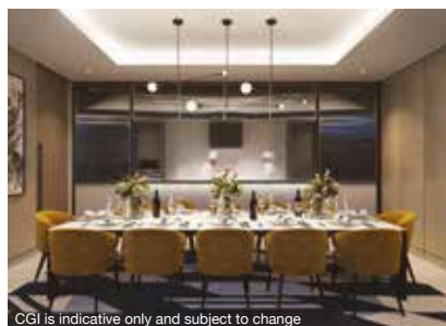
CGI is indicative only and subject to change