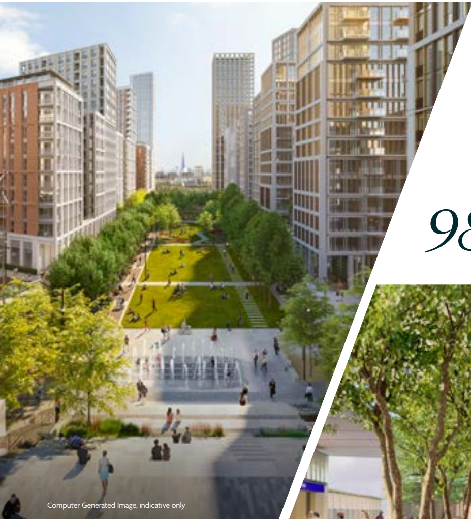
Computer Generated Image, indicative only