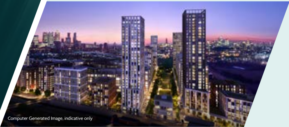
Computer Generated Image, indicative only