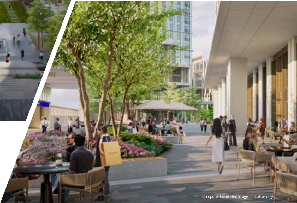
Computer Generated Image, indicative only