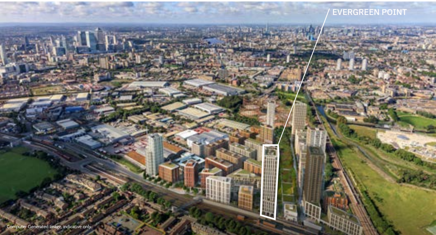
Computer Generated Image, indicative only