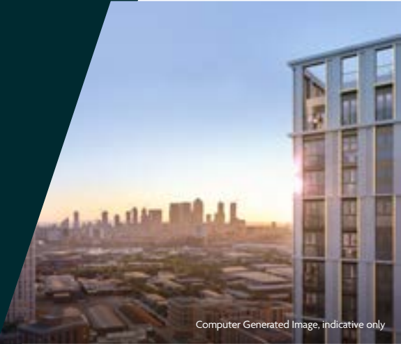
Computer Generated Image, indicative only

All facilities based in S01 are applicable for phase 1 and phase 2.