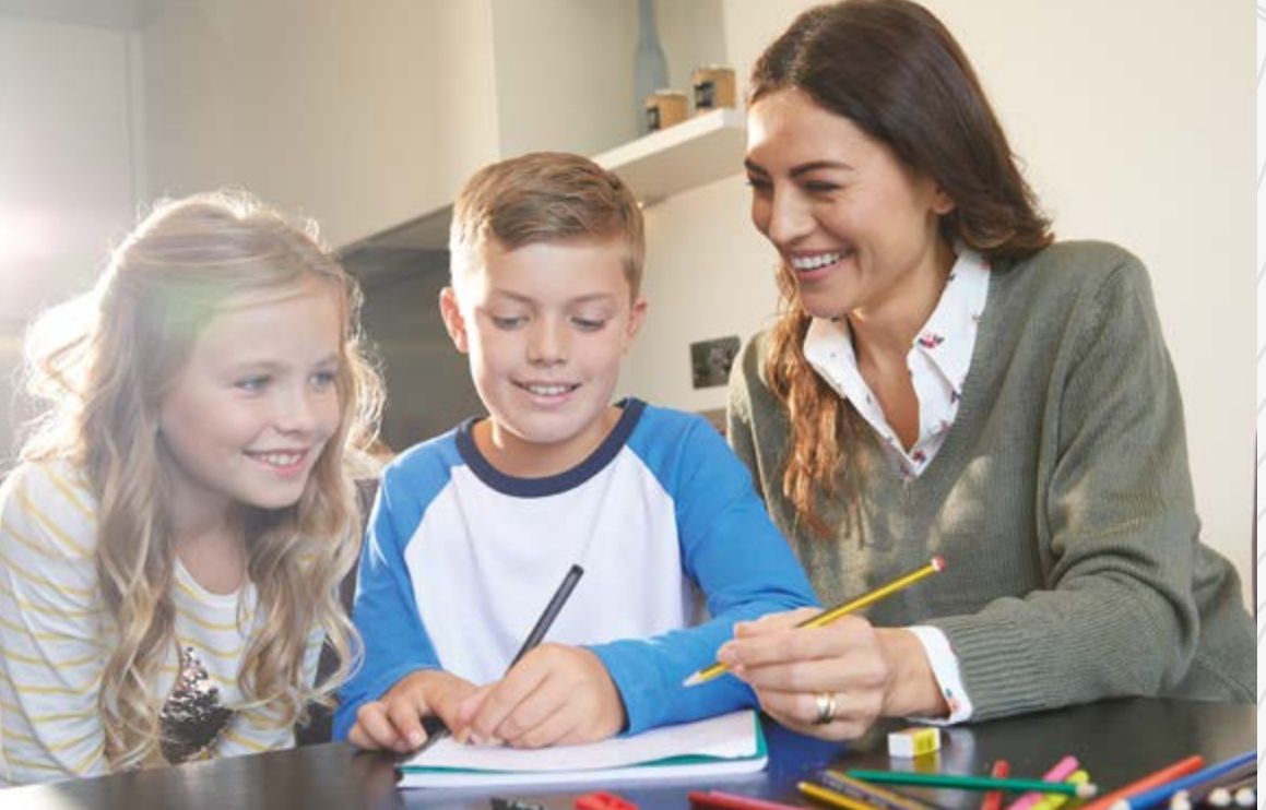
THE VILLAGER / ISSUE 02 / PAGE 5