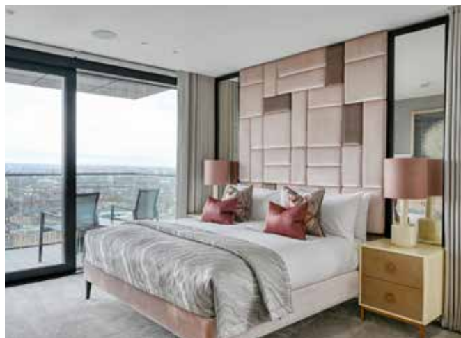
Actual photography of The Larchmont 27.01