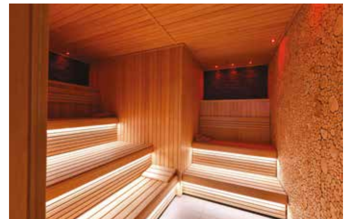
Photography of the facilities across The Dumont and The Corniche

The Dumont 27 Albert Embankment, SE1 7AQ