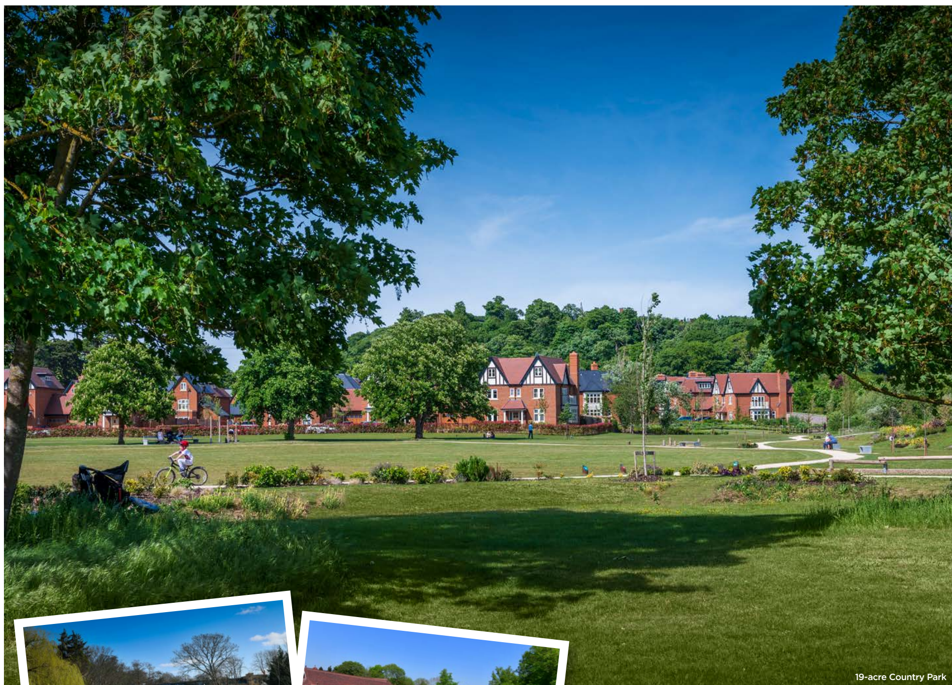
19-acre Country Park

The dazzling colours of summer are all around us at Taplow Riverside, reminding us that nature flourishes in abundance here, whether in the magnificent landscaped grounds, the country park or along the river banks.