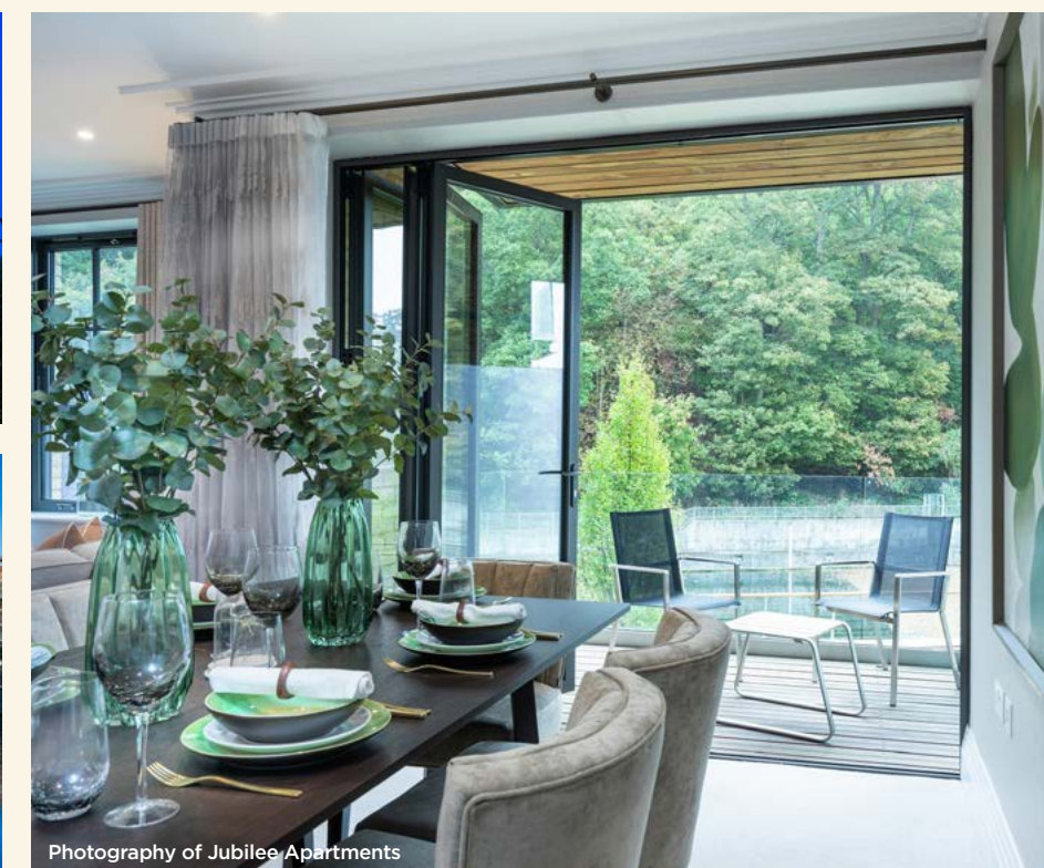
Photography of Jubilee Apartments

Marketing Suite and Showhomes Open Daily 10am to 5pm, Late Night Thursday to 7pm Mill Lane, Taplow, Buckinghamshire SL6 0AA | 01628 873512 | www.taplowriverside.co.uk