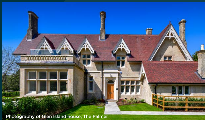
Photography of Glen Island house, The Palmer

An effortlessly elegant refurbished 3 bedroom apartment, rich in character and original period detailing.