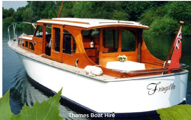
Thames Boat Hire