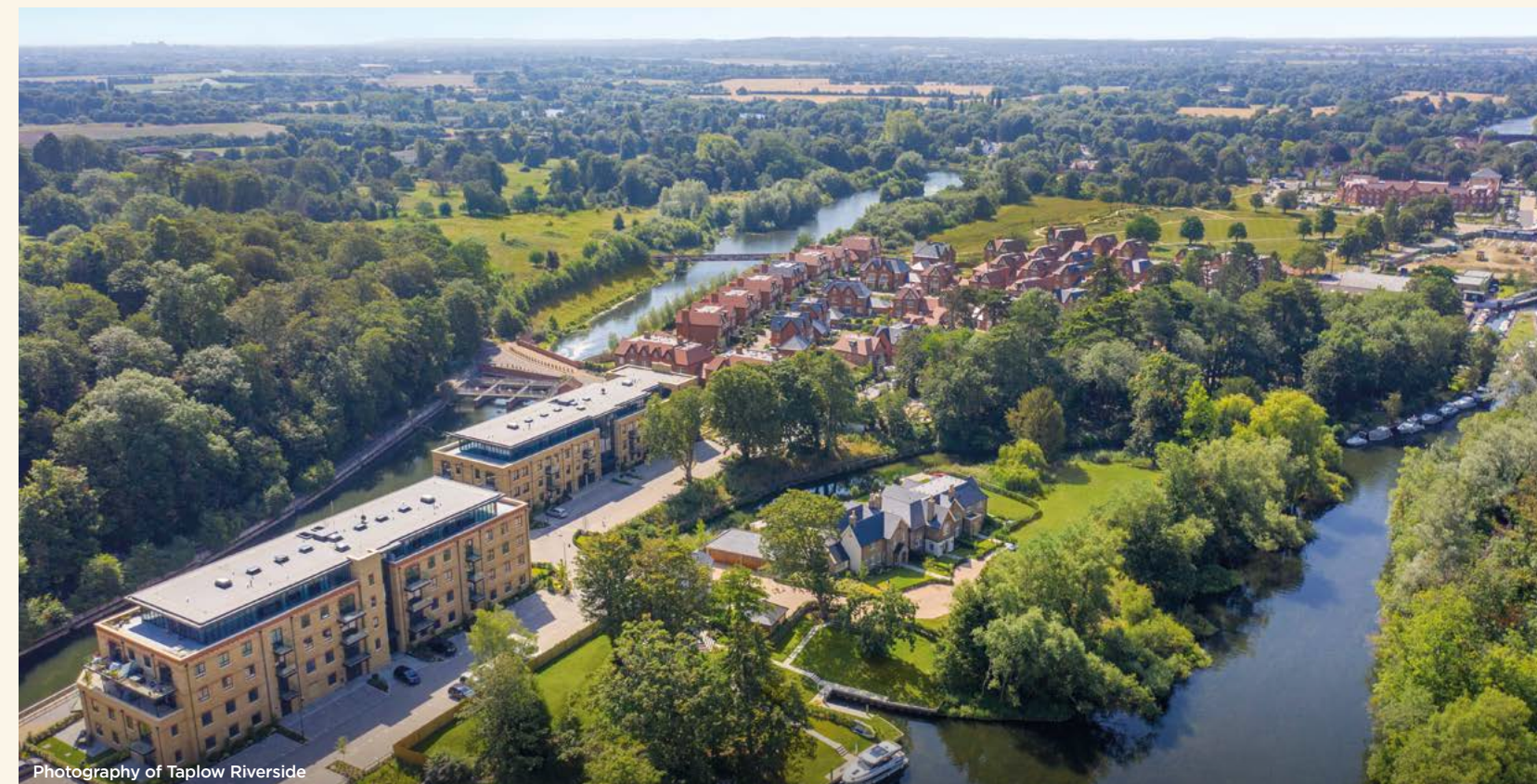
Photography of Taplow Riverside

2 bedroom apartments ready to move into from £499,950