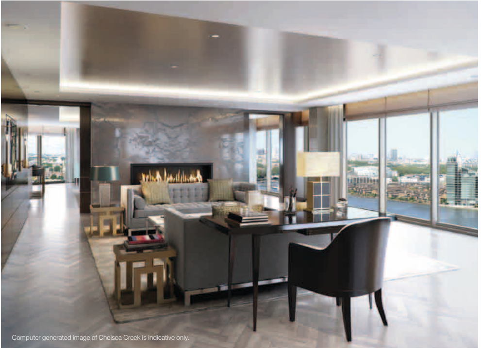
Computer generated image of Chelsea Creek is indicative only.

Recently launched and already attracting attention from around the world, the Penthouse and the Chelsea Suites at The Tower take prime riverside living to new heights.