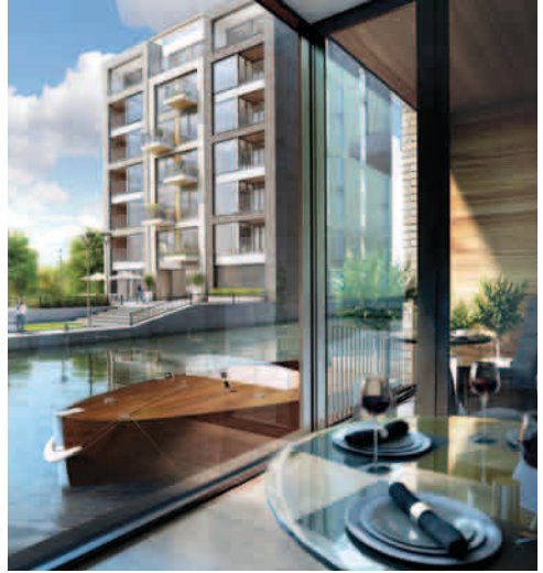
Computer generated image of Chelsea Creek is indicative only.

The beautiful landscaped parkland presents the ideal opportunity for those seeking a stylish apartment, close to Chelsea, Kensington and Knightsbridge.