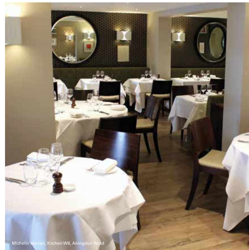
Michelin starred, Kitchen W8, Abingdon Road