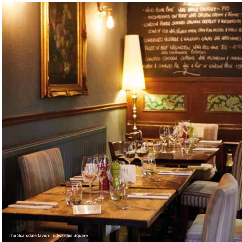
The Scarsdale Tavern, Edwardes Square