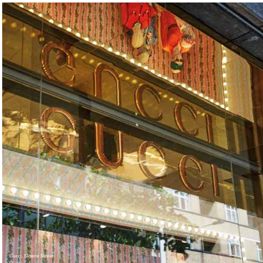
Gucci, Sloane Street