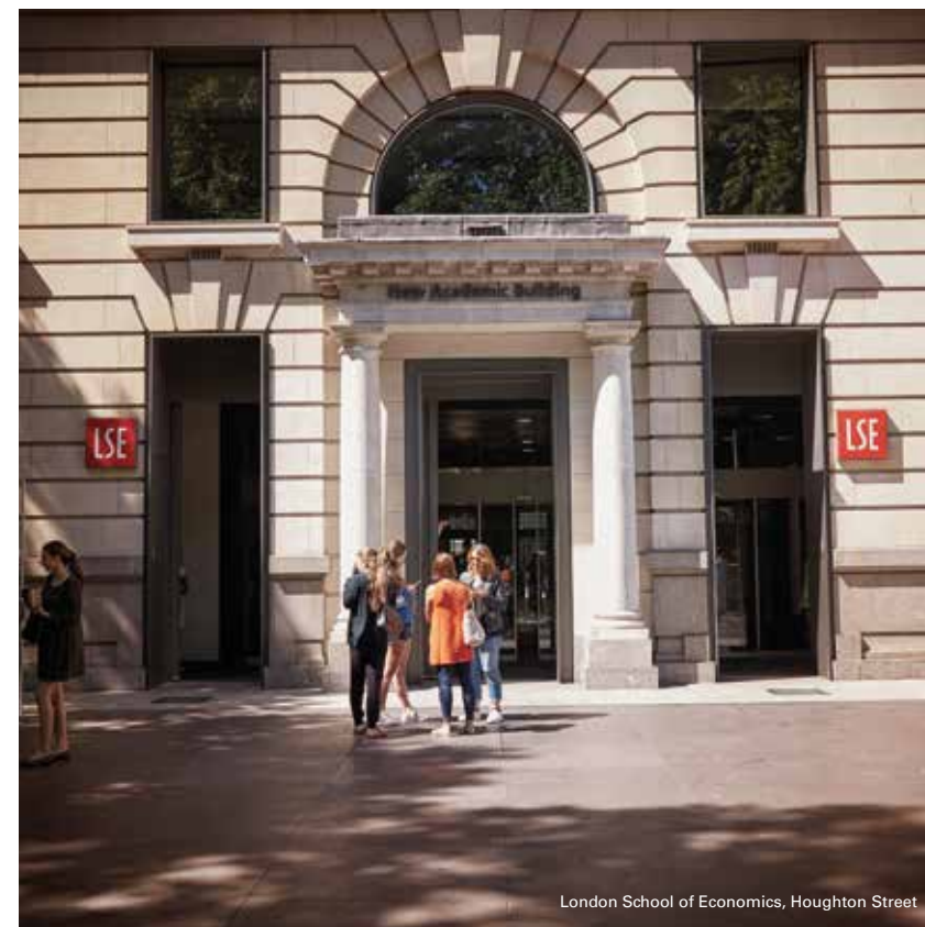
London School of Economics, Houghton Street