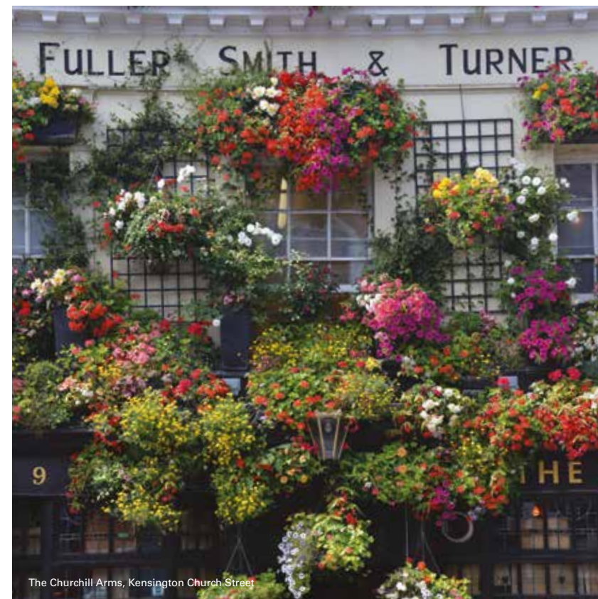
The Churchill Arms, Kensington Church Street