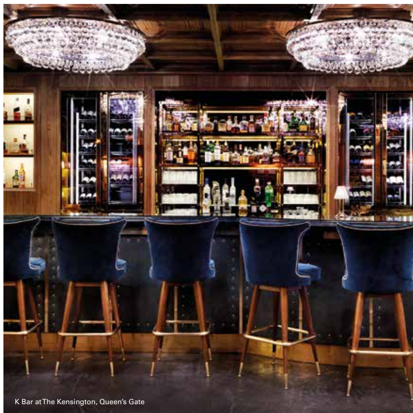
K Bar at The Kensington, Queen's Gate

“Kensington’s roof gardens are among London’s most glorious follies, complete with flamingos and an air fleet of resident ducks.”