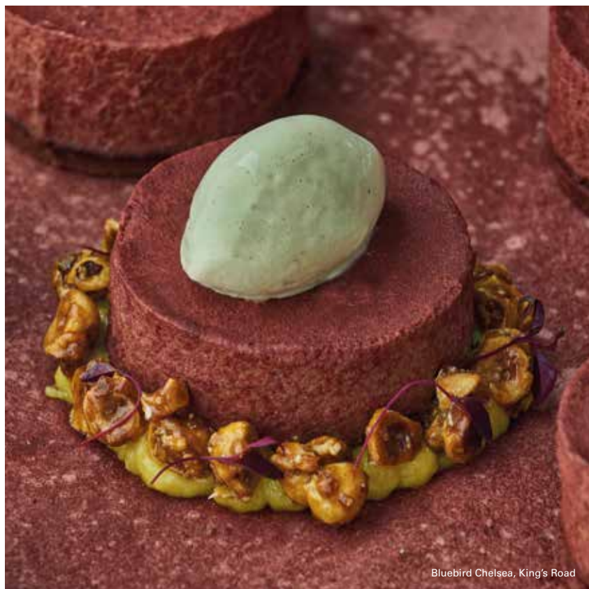
Bluebird Chelsea, King's Road