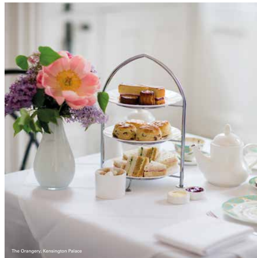
The Orangery, Kensington Palace

Elegant breakfasts, lunches and decadent afternoon teas in a unique palace garden setting.