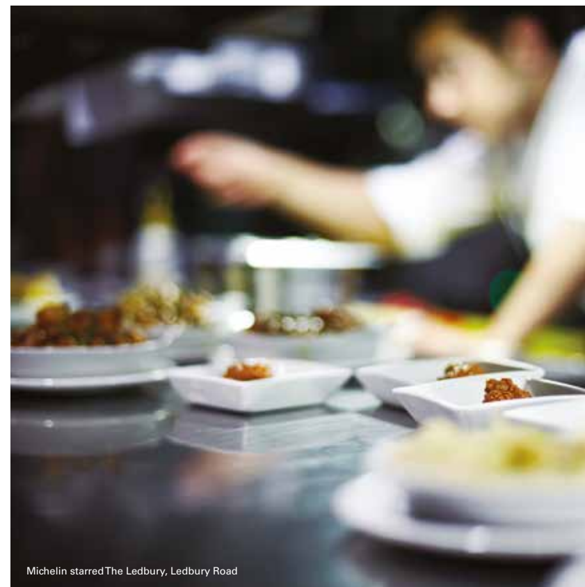
Michelin starred The Ledbury, Ledbury Road