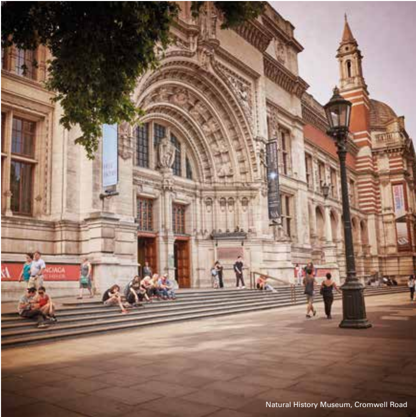
Natural History Museum, Cromwell Road

“Playing the Royal Albert Hall is like walking into my front room.”