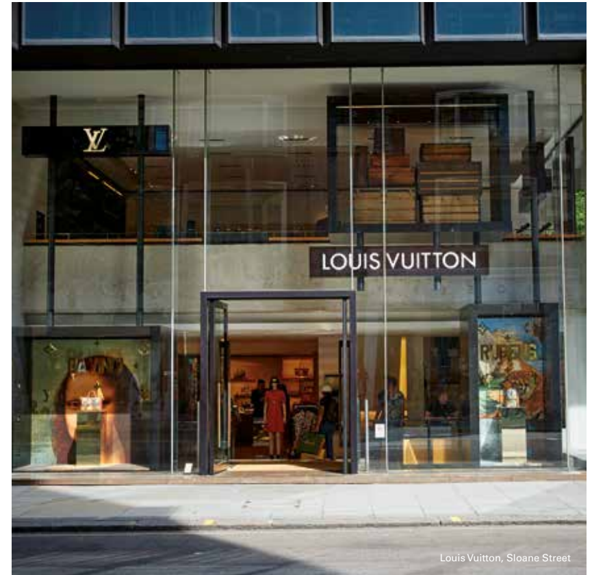
Louis Vuitton, Sloane Street