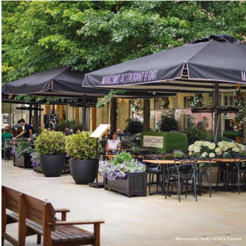
Manicomio, Duke of York Square

“There is no sincerer love than the love of food.”