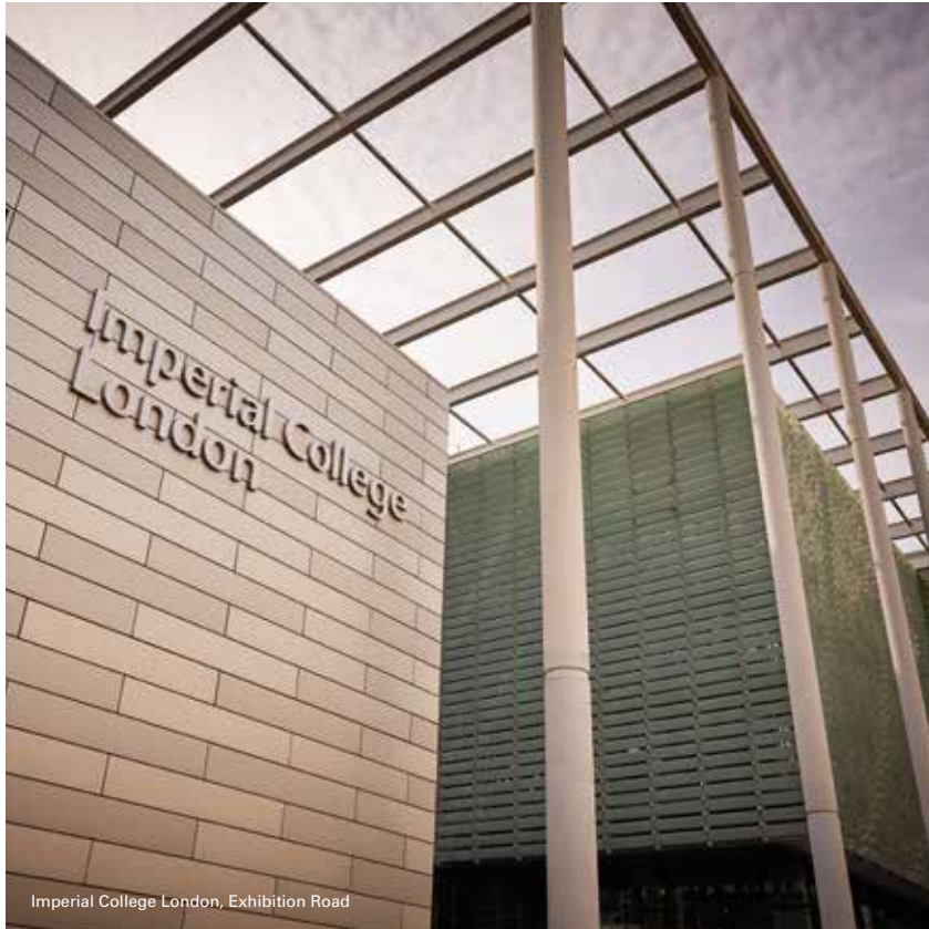
Imperial College London, Exhibition Road