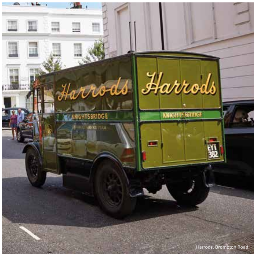
Harrods, Brompton Road