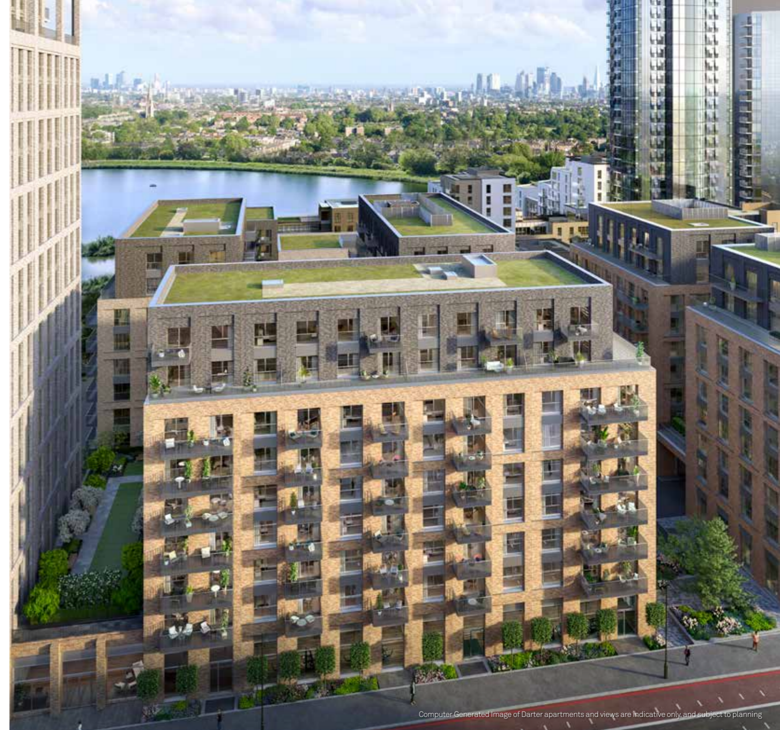
Computer Generated Image of Darter apartments and views are indicative only, and subject to planning

London-based firms dominated the majority of deals in 2020, attracting 91% of the total cash invested in UK FinTechs