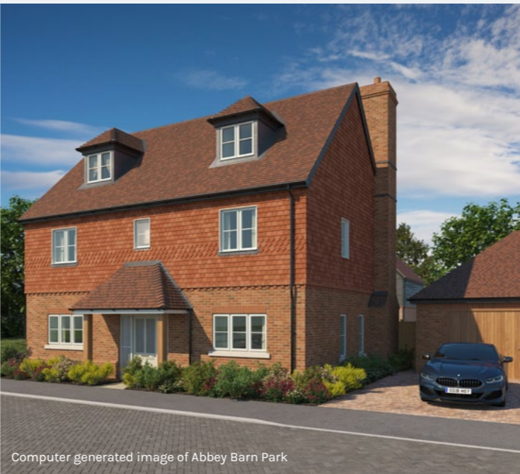
Computer generated image of Abbey Barn Park