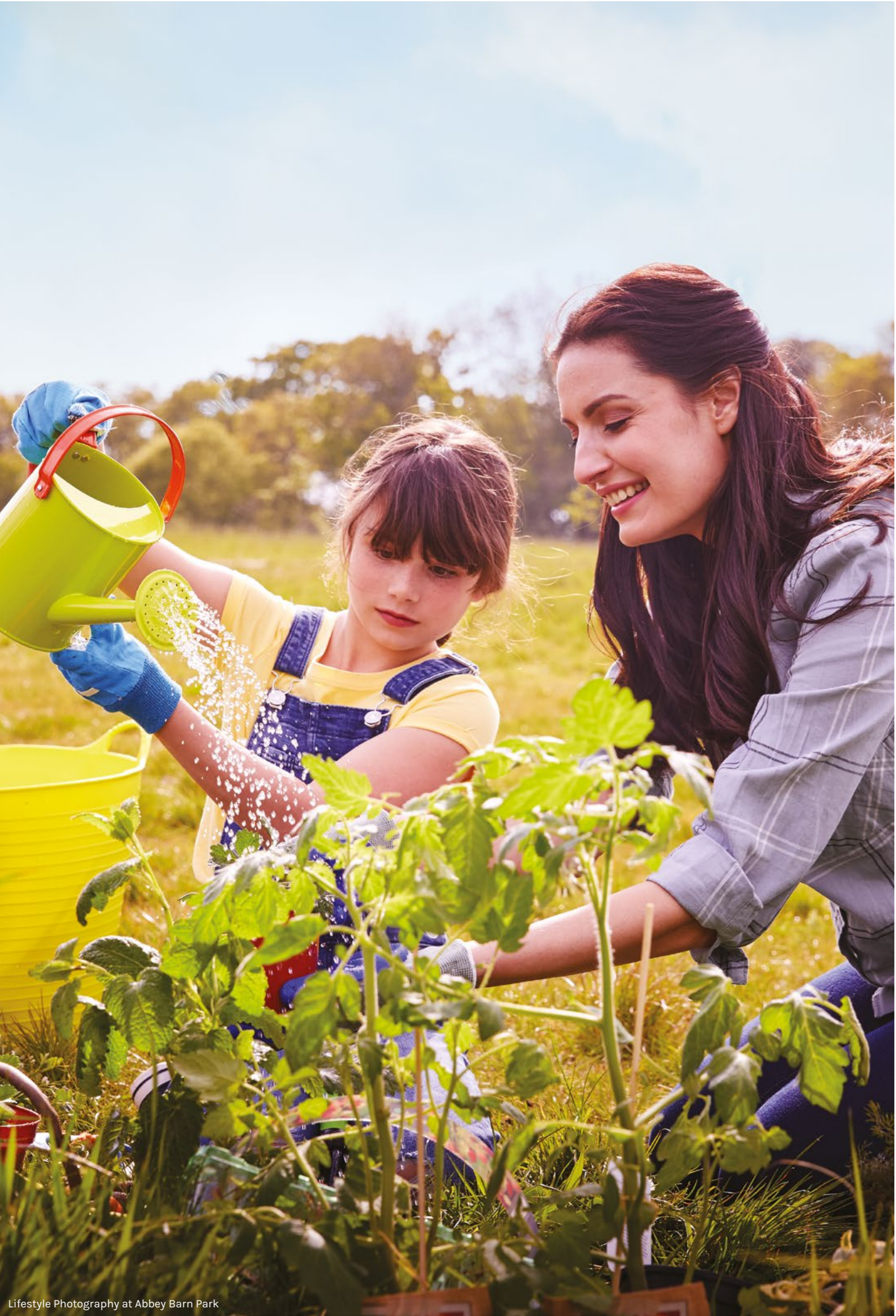
Lifestyle Photography at Abbey Barn Park