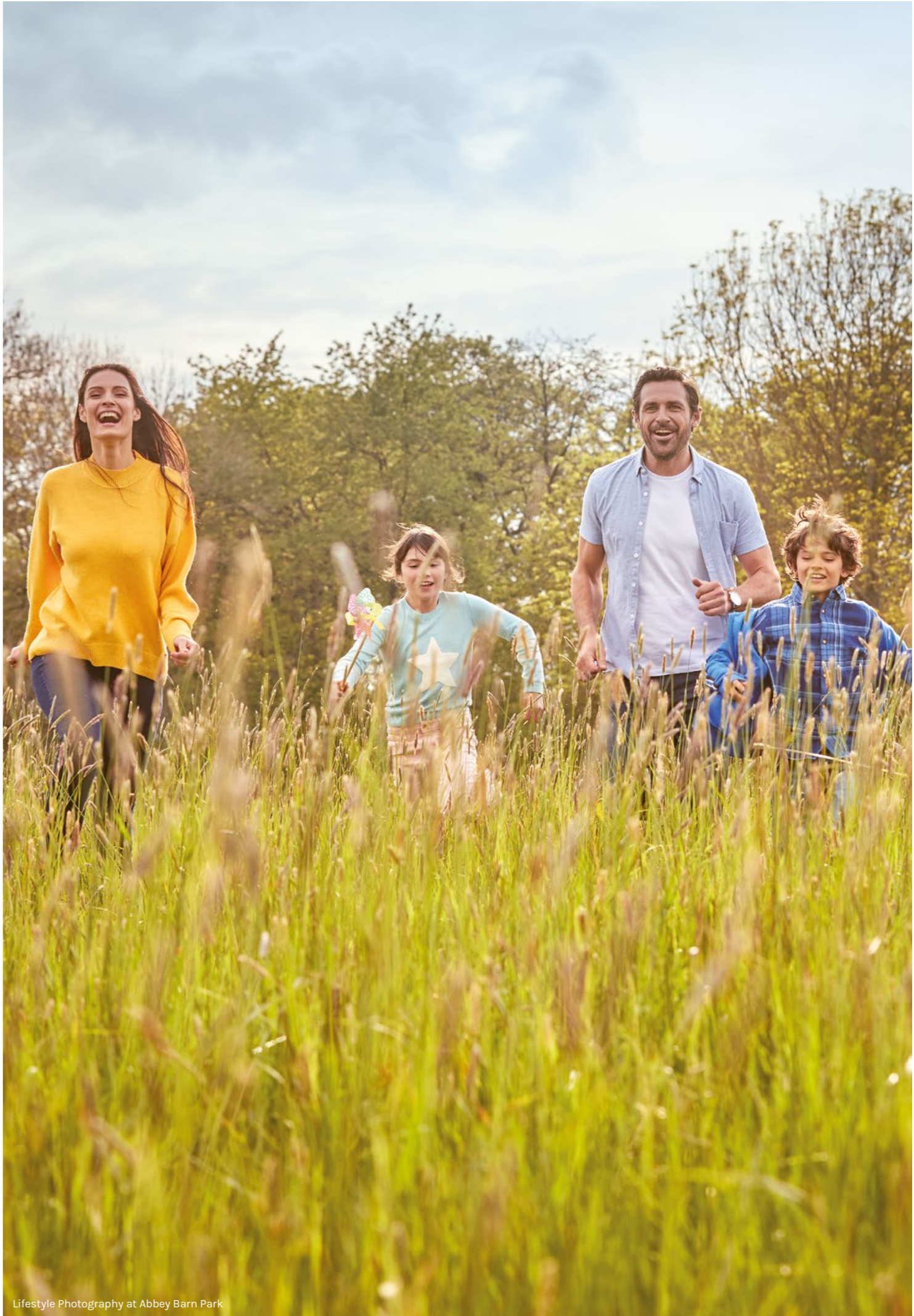
Lifestyle Photography at Abbey Barn Park

Berkeley has chosen these counties to build some of its most attractive and successful developments, blending quality homes, parks and public realm with great facilities. Each development has been carefully located to maximise convenience – close to direct train routes to London and Reading, and excellent shopping and entertainment facilities – making these counties the ideal lifestyle choice.