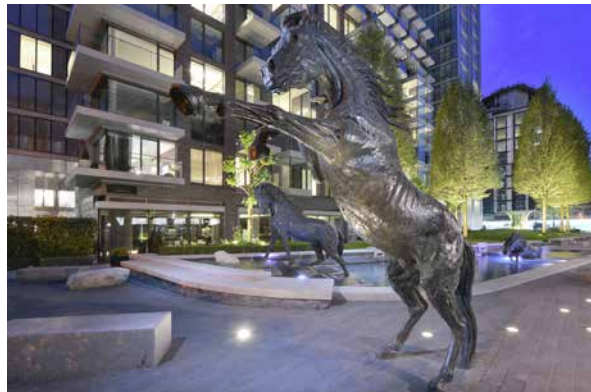
Photography depicts the feature lake at Stanmore Place and the Piazza at Goodman's Fields and is indicative only.