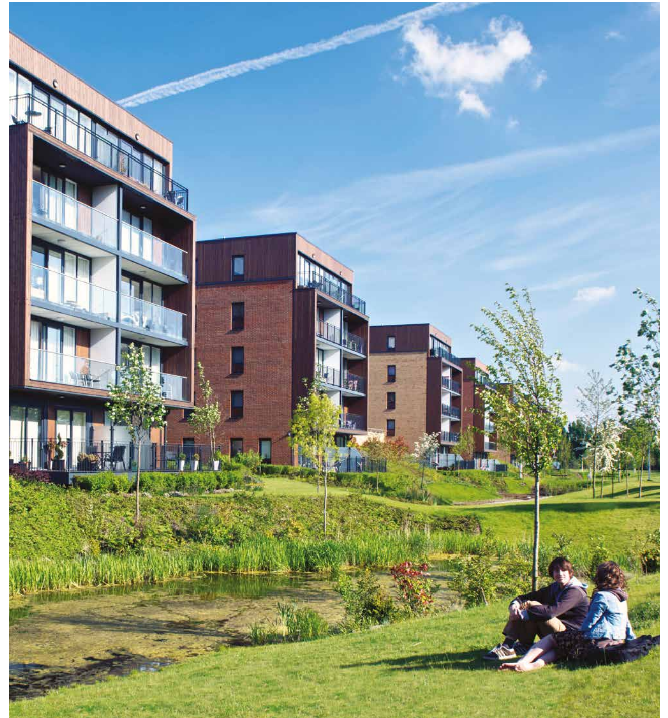
Photography depicts Kidbrooke Village and is indicative only.