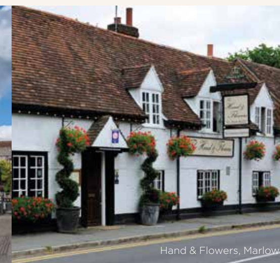
Hand & Flowers, Marlow