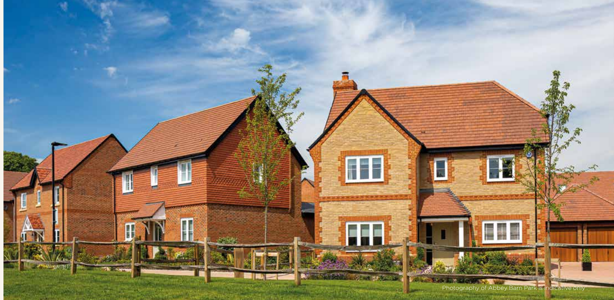
Photography of Abbey Barn Park is indicative only.