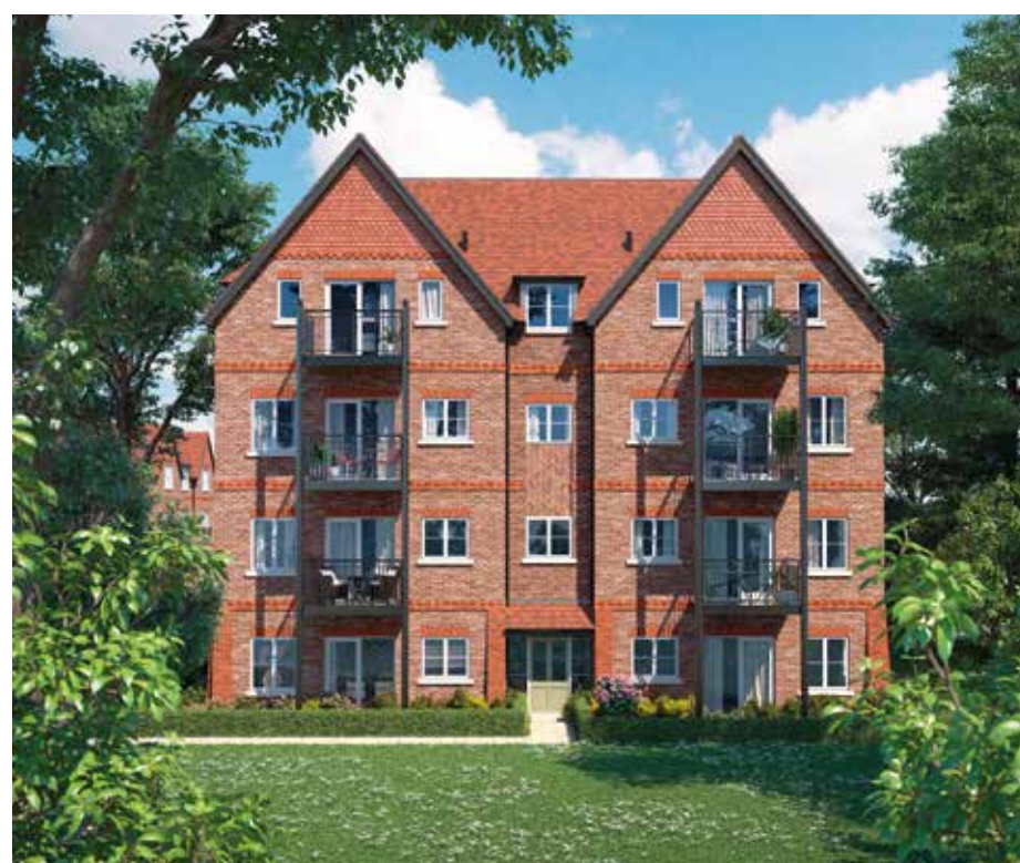
Apartment photography of a previous Berkeley showhome is indicative only

AVAILABLE WITH JUST A 5% DEPOSIT WITH HELP TO BUY - First Time Buyers only