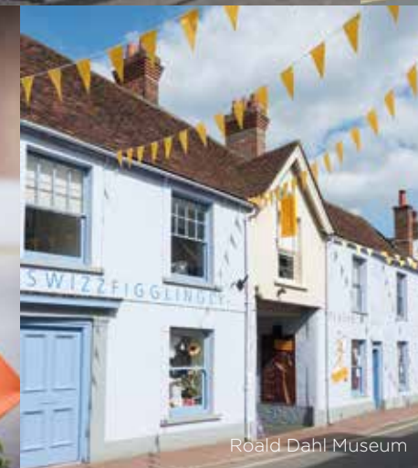
Roald Dahl Museum