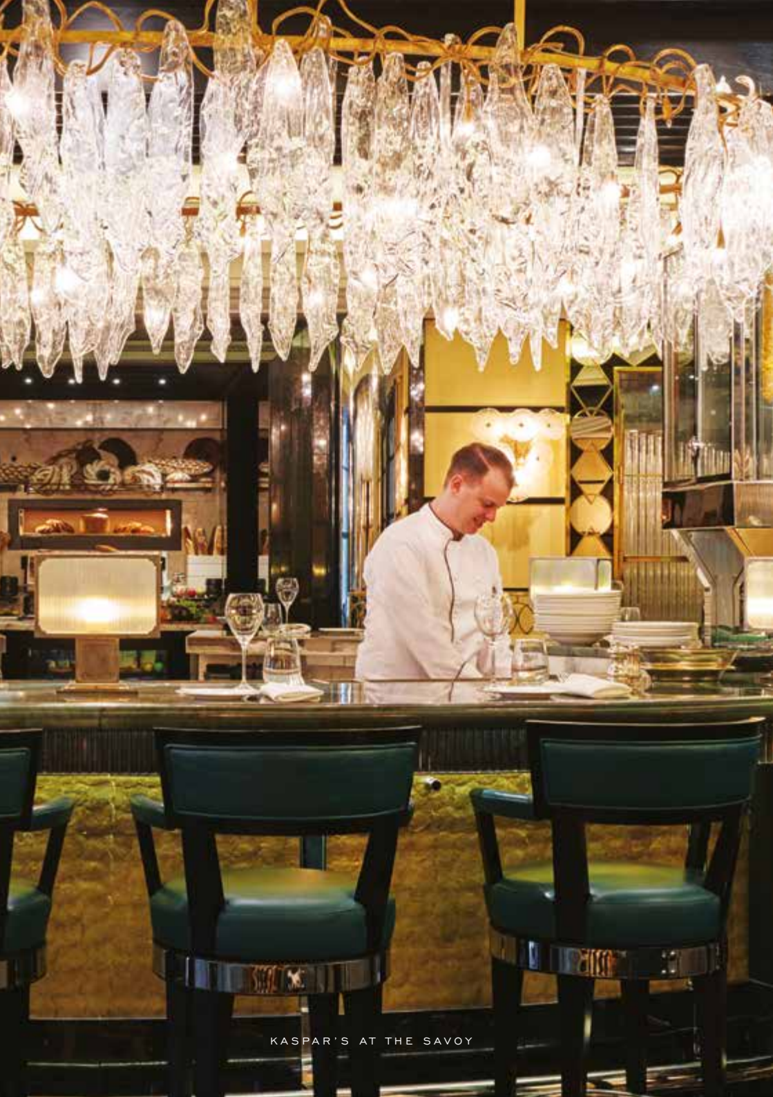
KASPAR'S AT THE SAVOY