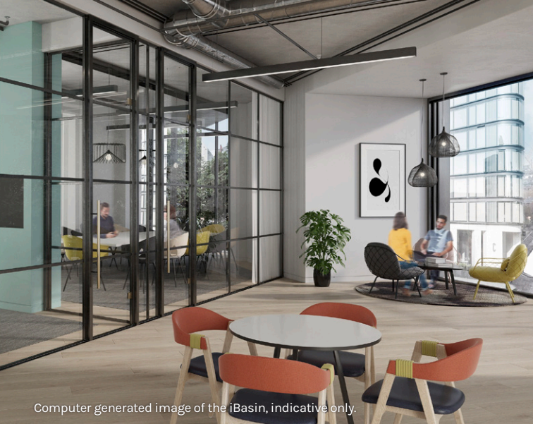
Computer generated image of the iBasin, indicative only.