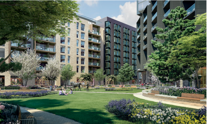
Computer generated images of 250 City Road, indicative only.

of new cafés, bars and restaurants will overlook a central plaza.