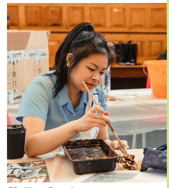
Gifted Young Generation

Each Berkeley Group operating business selects a local charity to partner with. These are usually small-to-medium sized organisations working in the local areas, and provide a focus of staff fundraising and volunteering.