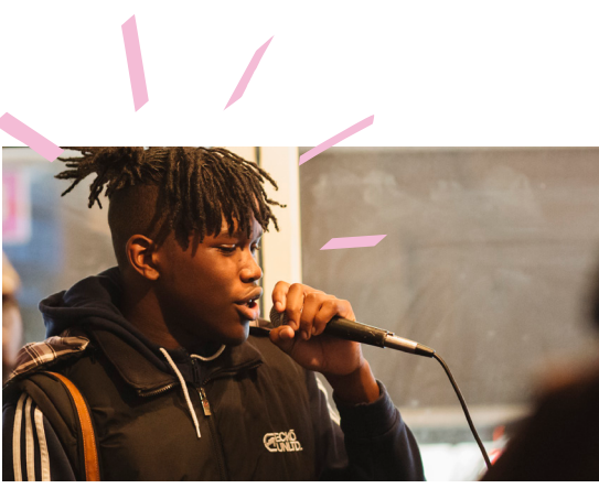
Art Against Knives

<sup>1</sup> IVAR (2021), The Berkeley Foundation, 2011-2021