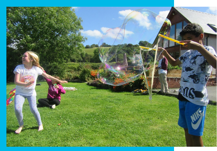
Honeypot Children's Charity