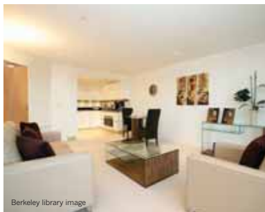
Berkeley library image

Waterside living at its best with great apartments designed for ease of living this really is a place to enjoy your lifestyle to the full.