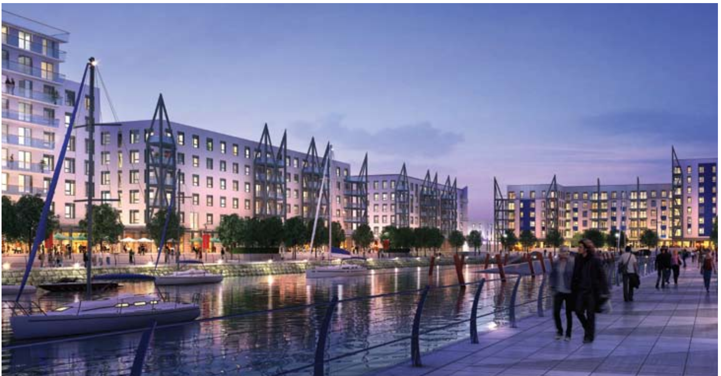
Computer generated image of Victory Pier at night