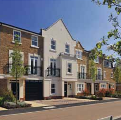
Top left Chelsea Bridge Wharf, London SW8, St Mary's Place, London SW15, Beaufort Park, London NW9, main image 375 Kensington High Street, London W14.

We also make a vital contribution to the landscape, to the communities we help create, and to the environment, through our commitment to excellence in design, sustainability, and addressing the needs of our customers and their neighbours.