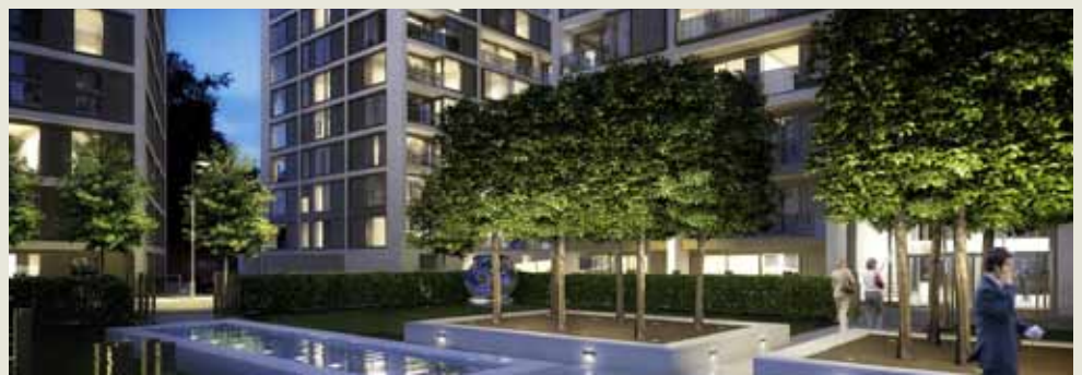
375 Kensington High Street