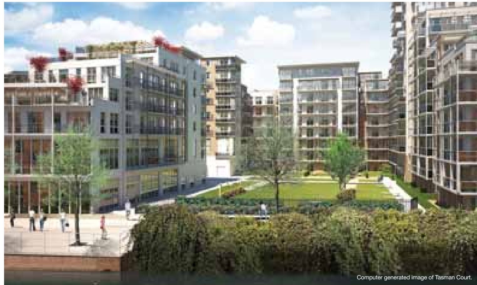
Computer generated image of Tasman Court.

Caspian Wharf is a stunning new development by Berkeley Homes, located in one of the worlds most cosmopolitan and vibrant cities.