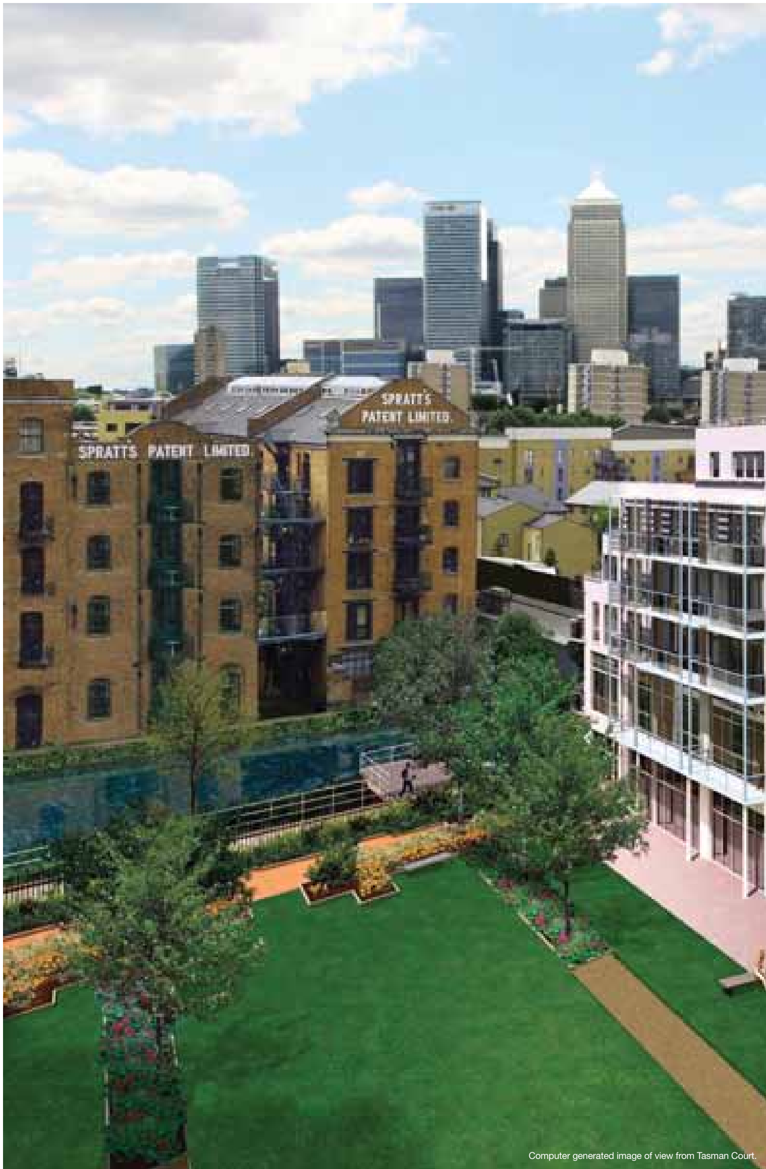
Computer generated image of view from Tasman Court.