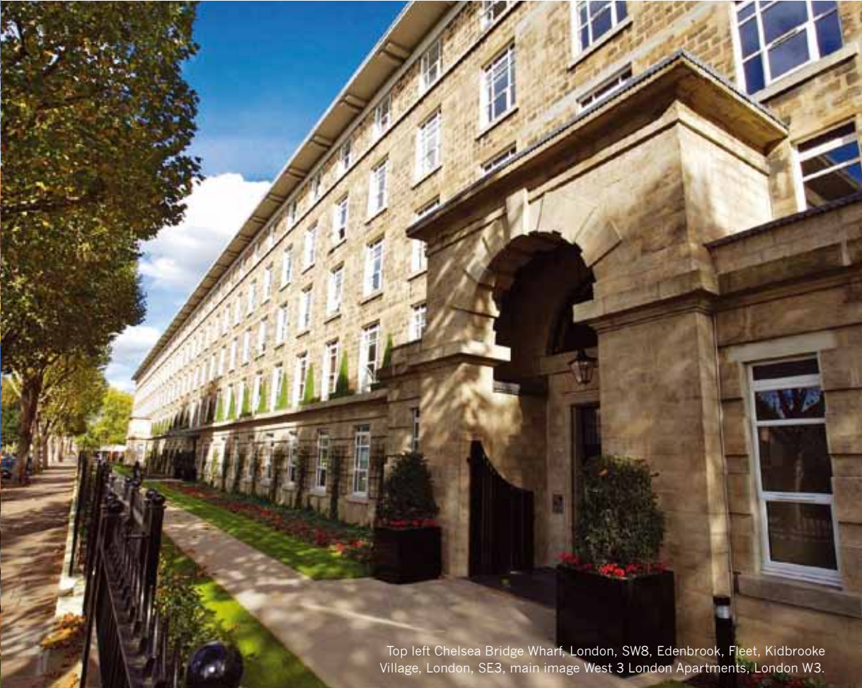
Top left Chelsea Bridge Wharf, London, SW8, Edenbrook, Fleet, Kidbrooke Village, London, SE3, main image West 3 London Apartments, London W3.