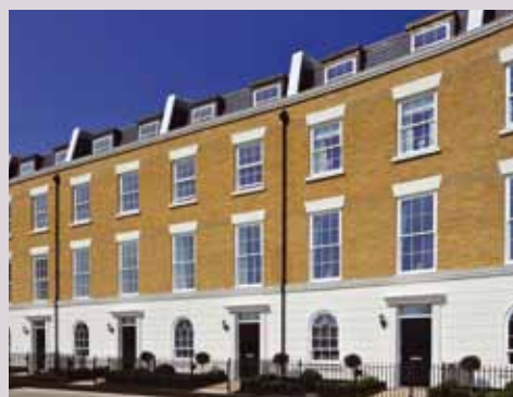
Kingsbrook Park, Canterbury

In each of these areas, Berkeley has made a number of commitments, the results of which are reflected in the homes that we build, the service that we offer to you, and the way we run our business.