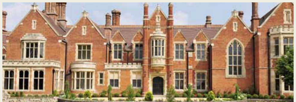
Summers Place, West Sussex