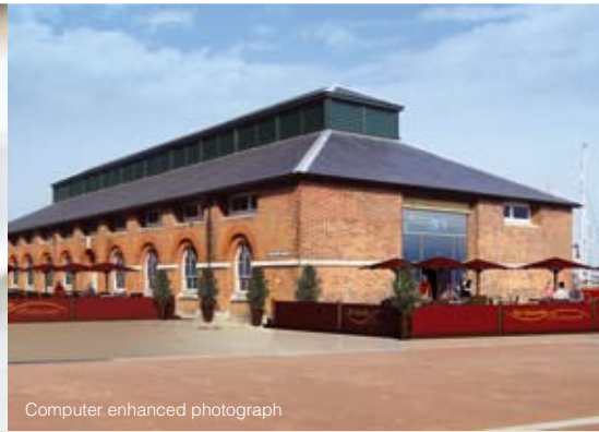
Computer enhanced photograph